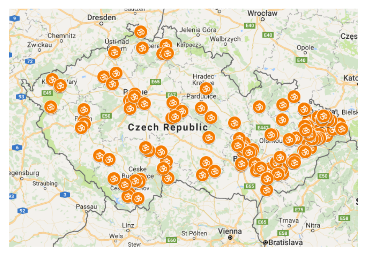
Figure 1 Summary overview of locations, where "Yoga in Daily Life" courses are running in the Czech Republic (n=157 places)